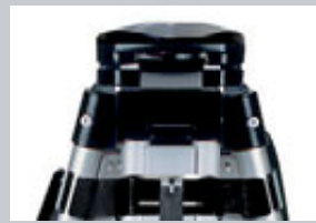
The 165 cm tall, ball-head tripod allows an AL 26 to be aligned rapidly.