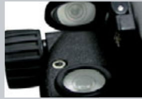
Practical, adjustable fold-up mirror for simple alignment with a circular spirit level.