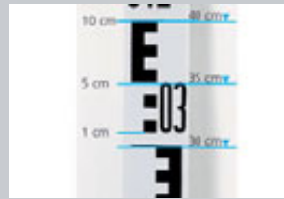
Long-distance scale with E graduation