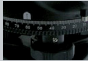
Horizontal circle with endless vernier adjustment for precise targeting.